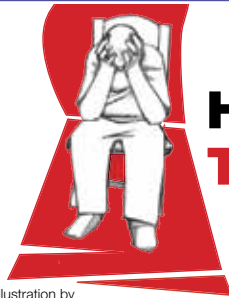
Illustration by Billy Nuñez, age 16